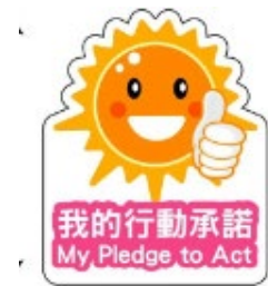
MPA Mascot (“樂諾小太陽”) Badges