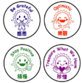
MPA Mascot (“樂諾小太陽”) Stamps