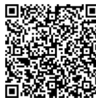
Values Education webpage “What’s New”