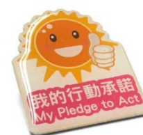
MPA Mascot Badge

To promote the implementation of the “MPA Ambassador School-based Award Programme”, the EDB will organise a variety of collective activities for “MPA Ambassadors” of primary and secondary schools in the 2025/26 school year. These activities may include visits to non-profit animal protection organisations, government departments, greening facilities and etc., as well as inviting them, on a priority basis, to participate in the values education movie appreciation and interactive theatre organised by the EDB. Details of the activities will be announced in due course in the 2025/26 school year for schools’ enrolment. The L&T resources, promotional materials and certificates for the “MPA Ambassador School-based Award Programme” have been uploaded to the MPA Theme-based Resources Webpage (please scan the QR code on the right) for schools to adapt and deploy flexibly.