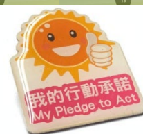
MPA Mascot Badge

The L&T resources, promotional materials and certificates for the “MPA Ambassador School-based Award Programme” have been uploaded to the MPA Theme-based Resources Webpage (accessible through the QR code on the right) for schools’ flexible deployment. Schools requesting the MPA Mascot Badges (“樂諾小太陽襟章”) (100 pieces per participating school) for the 2026/27 school year should complete the Reply Slip attached (please refer to Annex 2 ), and send it to Moral, Civic and National Education Section 1 by fax (fax number: 3426 9265) on or before 23 October 2026 (Friday) to facilitate necessary arrangements.