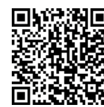
MPA Theme-based Resources Webpage